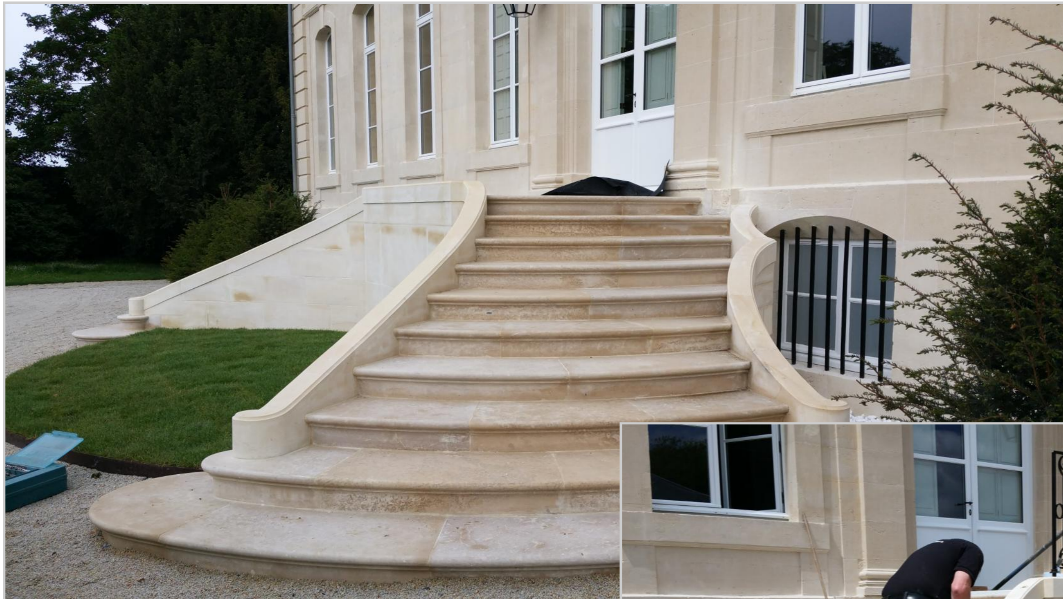
The new stone stair case and the installation of the balustrade. Each vertical section is fixed into a core drilled hole .