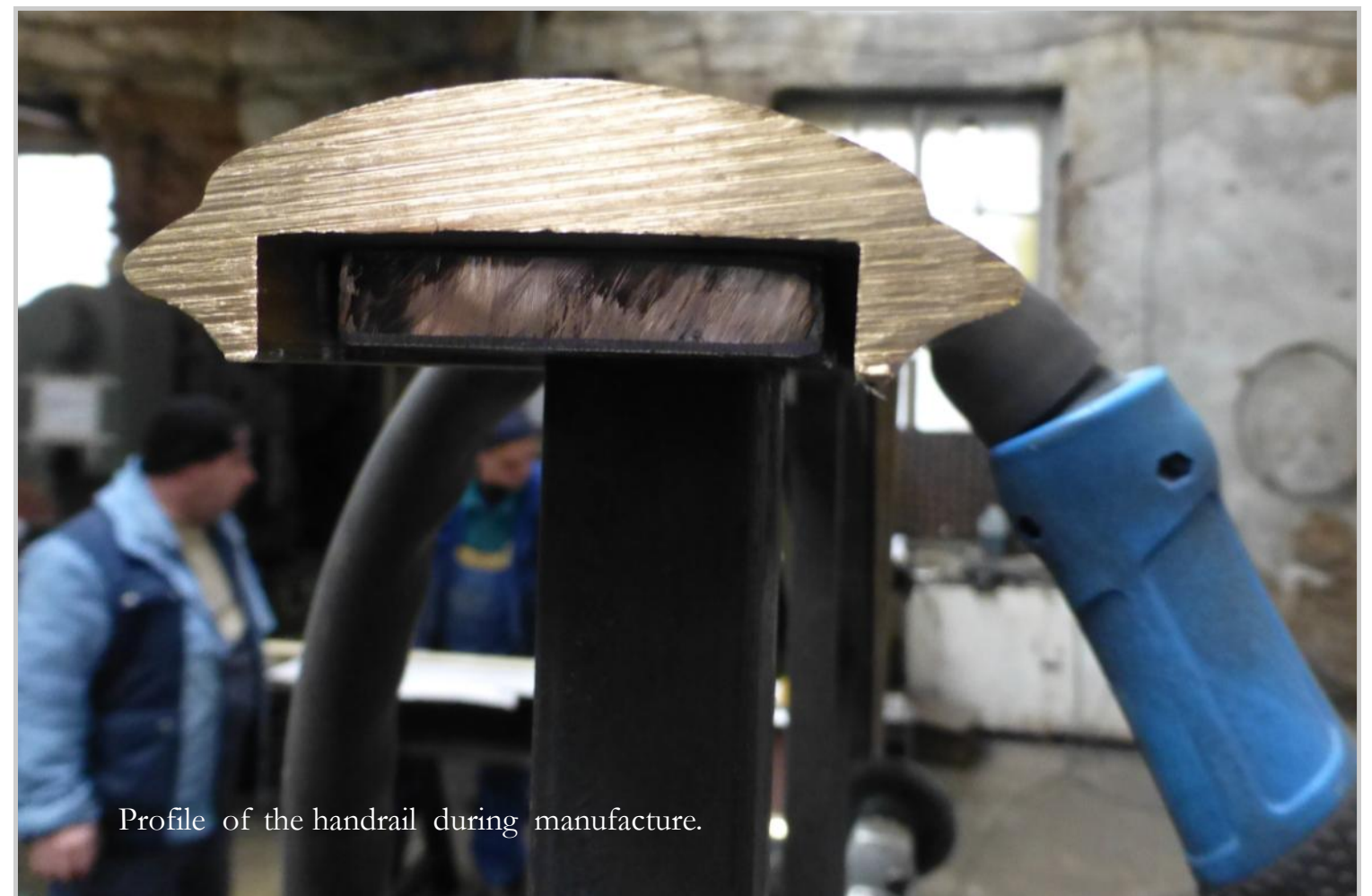
Profile of the handrail during manufacture.