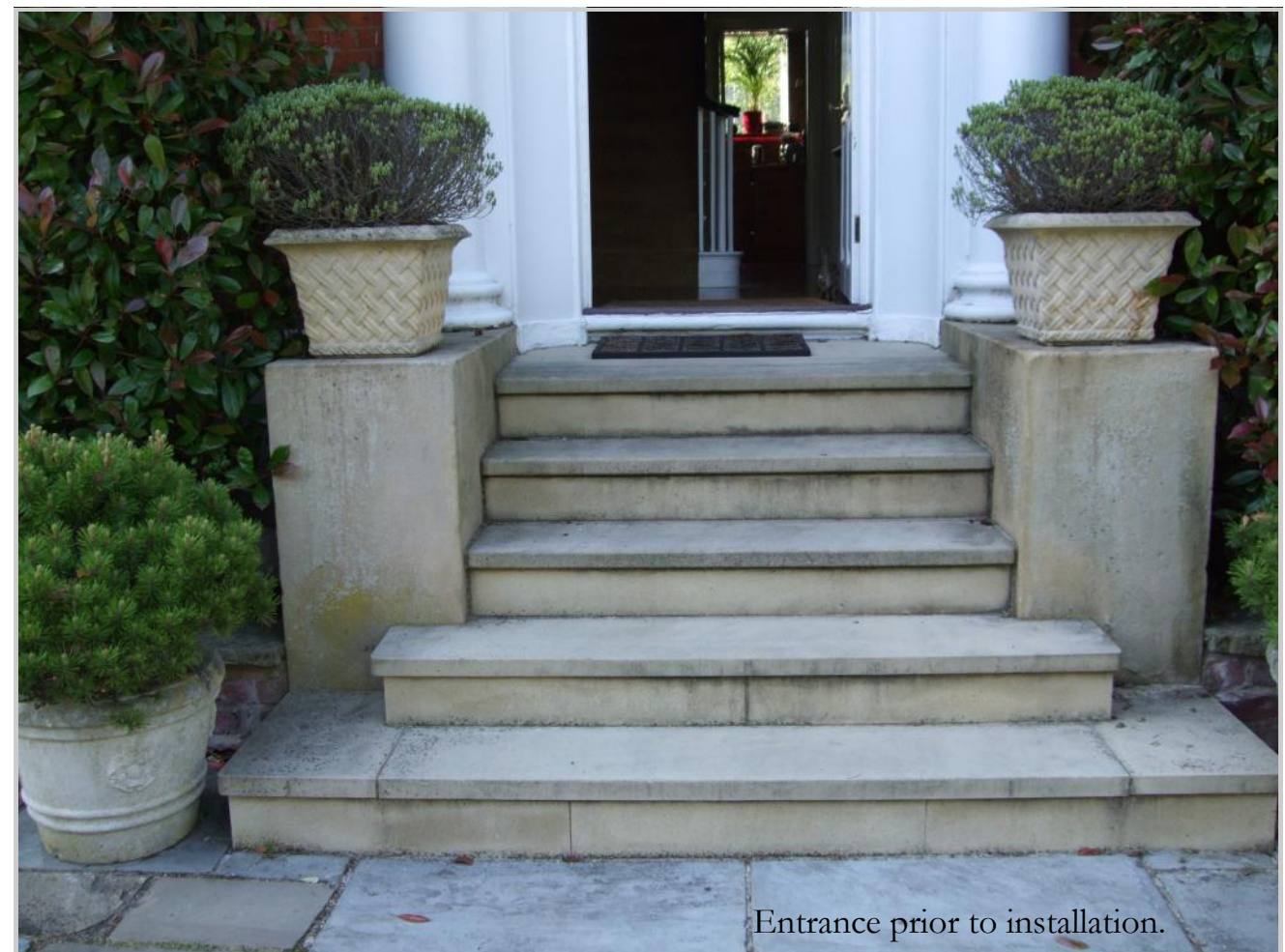
Entrance prior to installation.