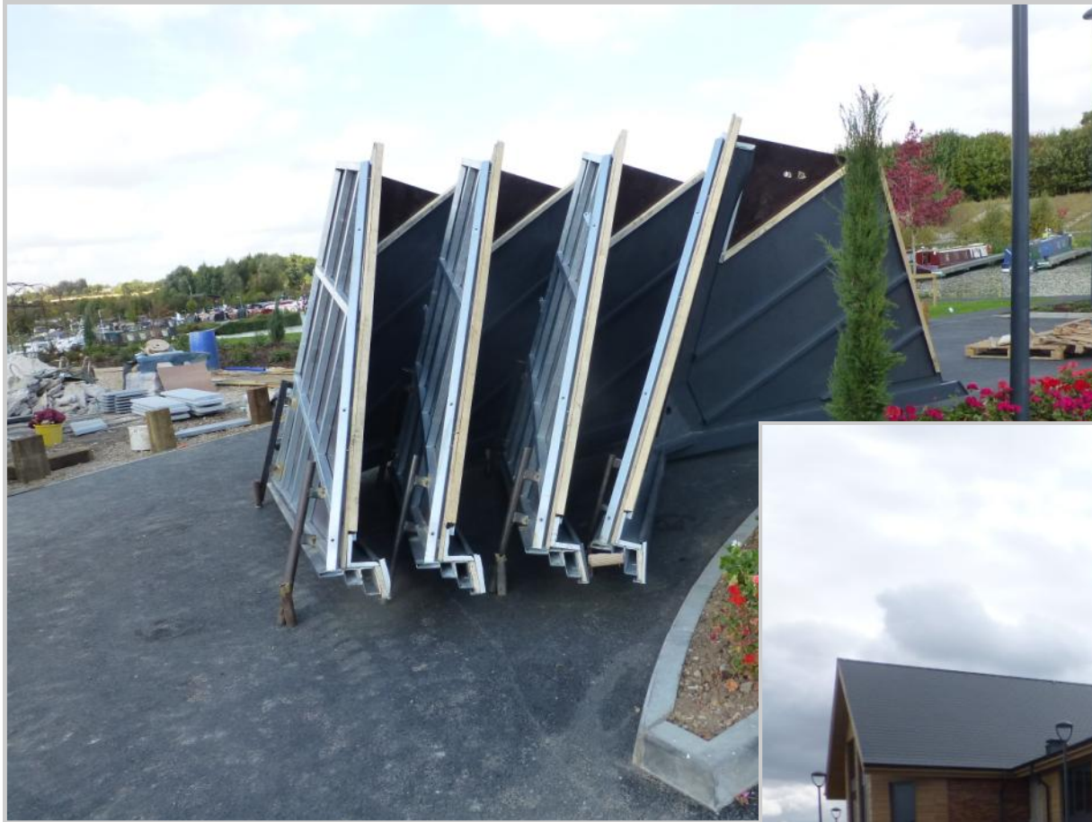
The foundation pad for the event stand is put down by the client prior to delivery.